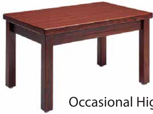
Occasional High Table