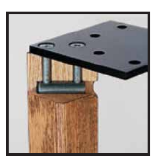
Slug & Bolt

Helicoils are used for maximum holding power.