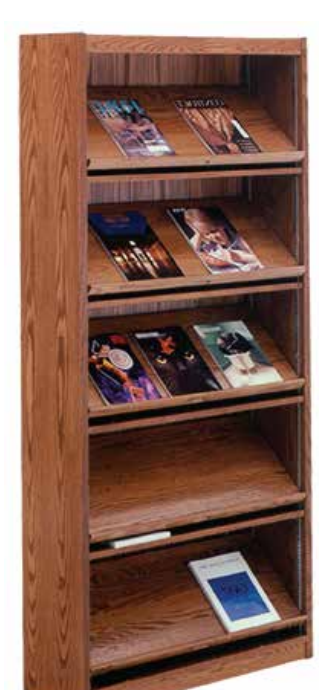
Did you know?

Slug-and-bolt leg assembly provides strength and stability with metal-to-metal fastening.